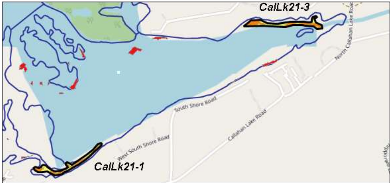
Figure 2: 2021 EWM management areas in Callahan Lake