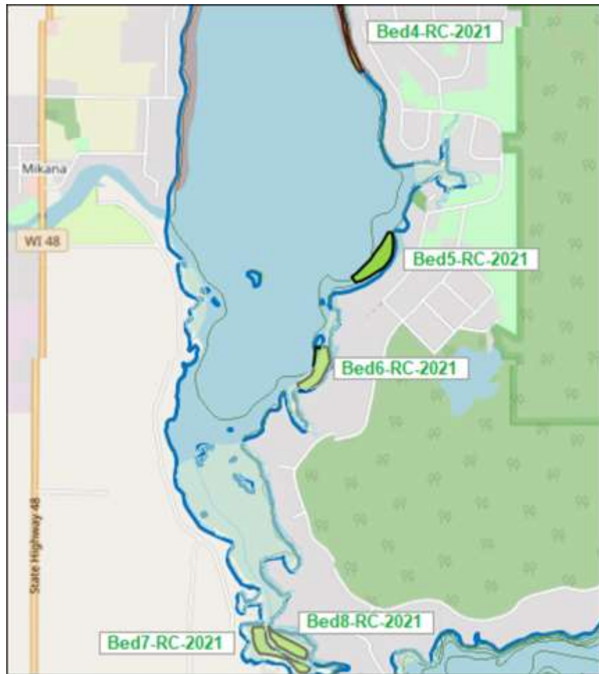
Figure 1: 2021 CLP management areas in Red Cedar Lake, Barron County