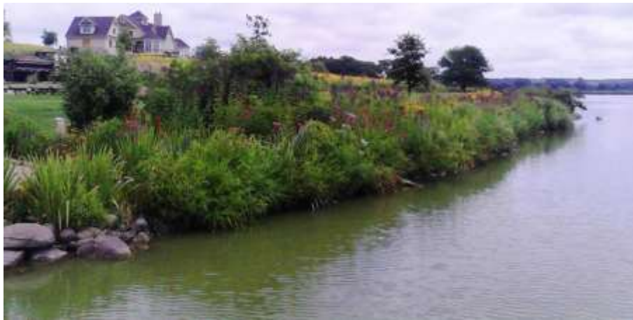
Figure 4: Completed Native Planting

Native plantings (Figure 4) are intended to establish a buffer zone between the developed portion of a parcel and the lake. The buffer helps filter and slow rainwater runoff so much of it filters into the ground. This buffer zone is created by changing a strip of turf grass, at least ten feet wide, along the shoreline to a natural area composed of native shoreline plants. Similar to rain gardens, these are fairly low maintenance requiring water only until the plants have become established. The only ongoing maintenance is the removal of any invasive species that find their way into the planting. On average, native plantings cost around $1000. This project will work for almost any developed parcel that does not have a sand beach as the primary frontage.