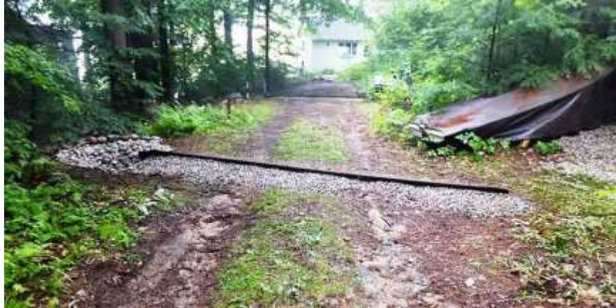
Figure 5: Completed Diversion

of these range anywhere from $25 to $3,750, but the average diversion costs $200. These are very low maintenance, and only require some debris removal that could get stuck in the diversion and occasionally ensuring everything is still secure and in place. This practice does not work well for the purposes of this particular survey, but it is mentioned here as a nod to projects that could be completed further inland than this survey was meant to assess.