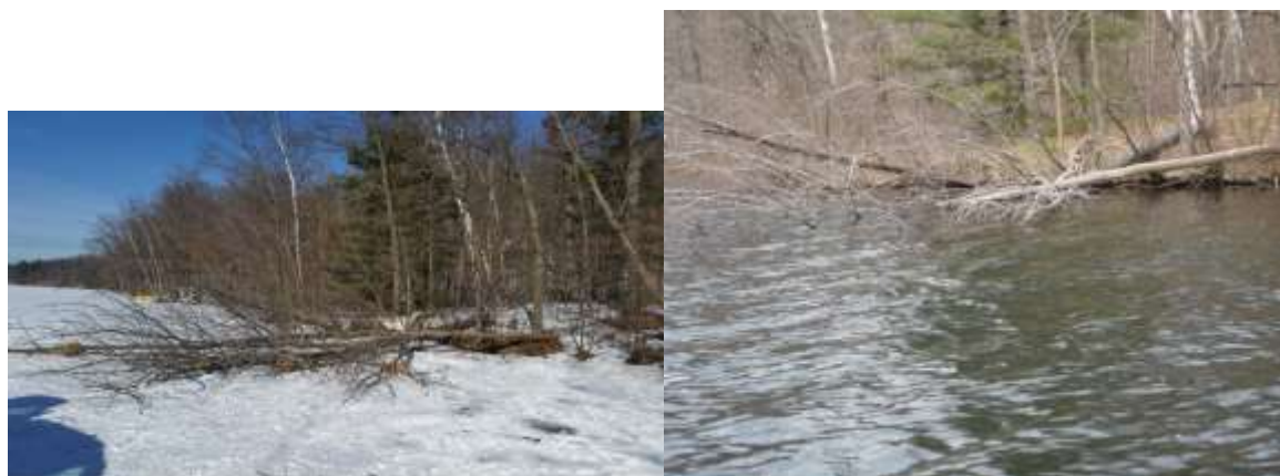
Figure 2: Fishsticks installation (left) and after ice out (right).

Fish sticks (Figure 2) is taking trees from inland, and installing them in the lake to mimic shore trees that will eventually fall into the lake. The trees used must be taken from a minimum of 35 feet inland and are then secured to the shore with cables for approximately 3 years. This provides habitat for fish, birds, and many other animals. In addition to providing habitat, fish sticks help protect the shoreline from bank erosion. Fish sticks project costs range anywhere from $100 to $1000, averaging about $500. These are very low maintenance because it is only necessary to occasionally check the cables to ensure they are secure. This practice would work well for almost any of the developed parcels on the flowage.