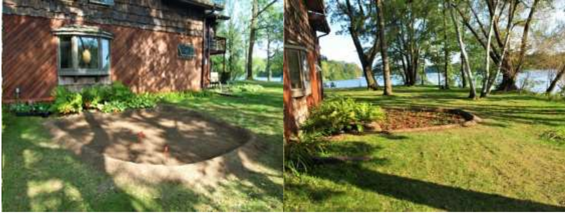
Figure 3: Rain Garden Installation (Left) and Upon Completion (Right)

Native plantings (Figure 4) are intended to establish a buffer zone between the developed portion of a parcel and the lake. The buffer helps filter and slow rainwater runoff so much of it filters into the ground. This buffer zone is created by changing a strip of turf grass, at least ten feet wide, along the shoreline to a natural area composed of native shoreline plants. Similar to rain gardens, these are fairly low maintenance requiring water only until the plants have become established. The only ongoing maintenance is the removal of any invasive species that find their way into the planting. On average, native plantings cost around $1000. This project will work for almost any developed parcel that does not have a sand beach as the primary frontage.