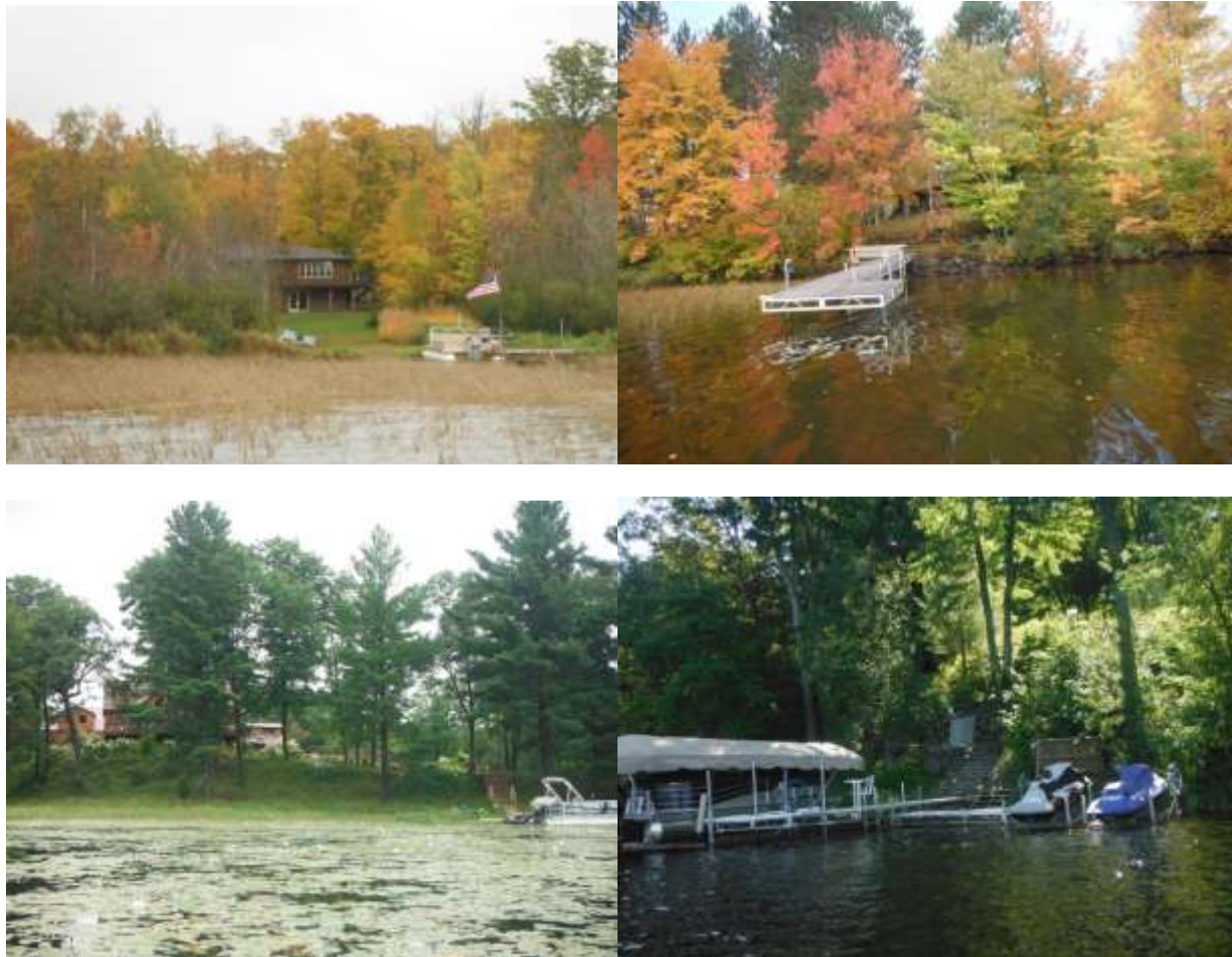
Figure 7: Developed Parcels with a "No Potential" Ranking

These parcels are simply meant to give property owners an idea of property owners who are able to make the most of their lakefront property while still having very little negative impact on the lake itself.